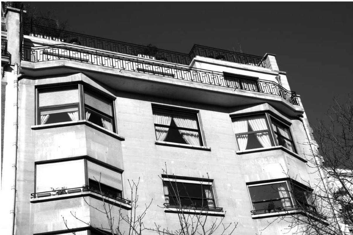
Facade 51 rue Manin, Paris